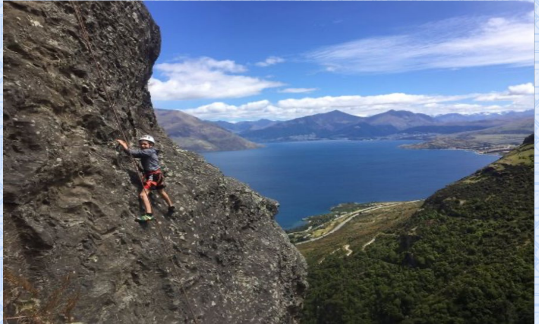
Wye Creek Rock Climbing

There are numerous areas for single pitch and multipitch climbing not far from Queenstown, perhaps the largest being Wye Creek.