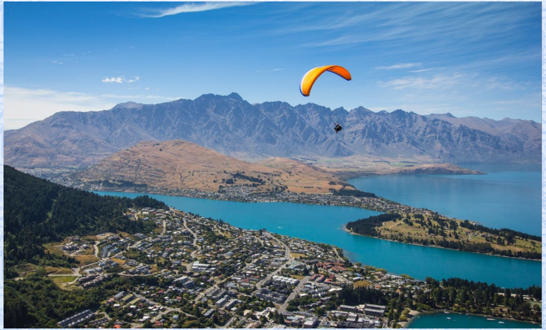
Paragliding over Queenstown