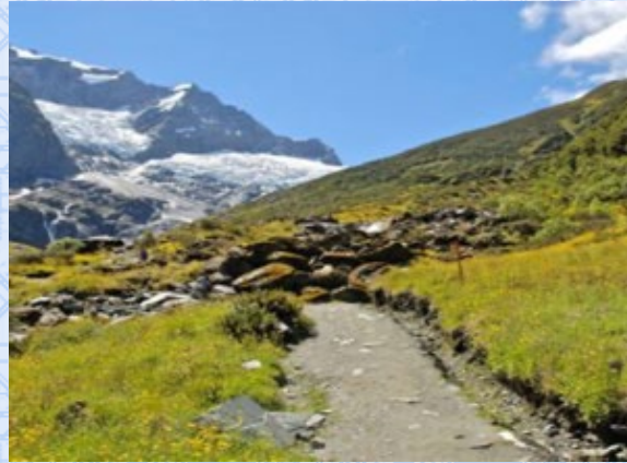
Rob Roy glacier hike, Wanaka

https://www.queenstownnz.co.nz/stories/post/best-short-walks-in-queenstown-ranked-by-difficulty/