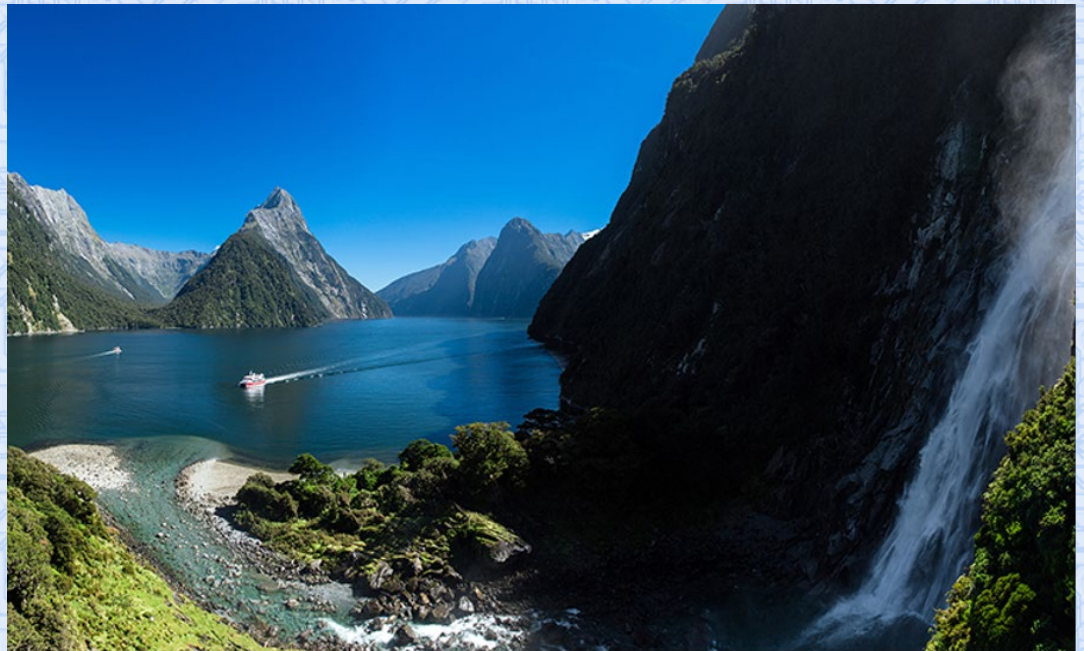
Bowen Falls, Milford Sound, South Island, NZ

Queenstown is often described as the adventure capital of the world. It lies on the South Island of New Zealand, an area that offers some of the world's most dramatic scenery. Queenstown lies in the southwest of the South Island, between Mt Aspiring National Park and Fjordland National Park, on the shores of Lake Wakatipu, and surrounded by the Remarkables mountain range. It can be reached by flights from Auckland, Wellington, and Christchurch among other airports in New Zealand, and from airports in Australia as well. Travel options are found on this website on the link 'TRAVEL'. Especially attendees from the northern hemisphere should consider staying after (or possibly before) ASIC to visit other sites in New Zealand or Australia.