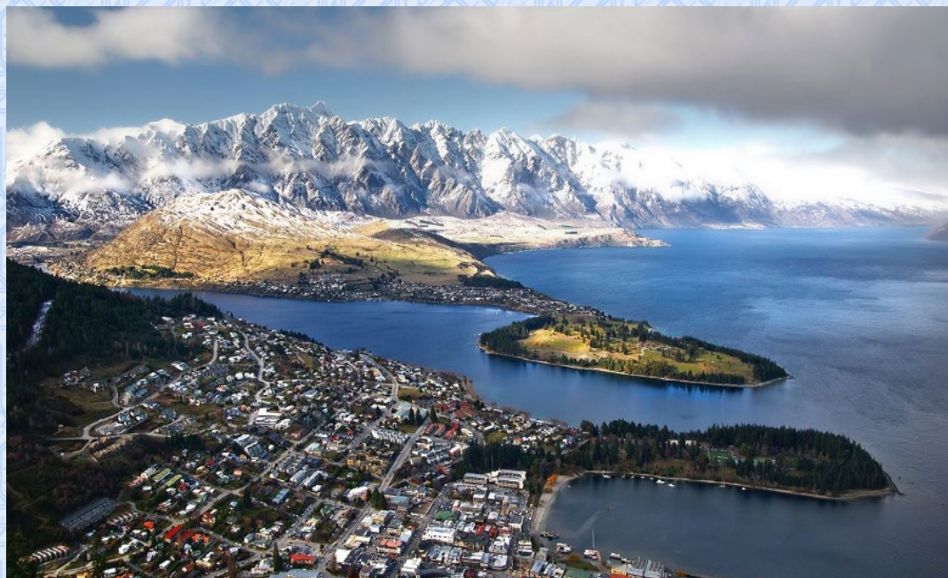
Above: The town of Queenstown