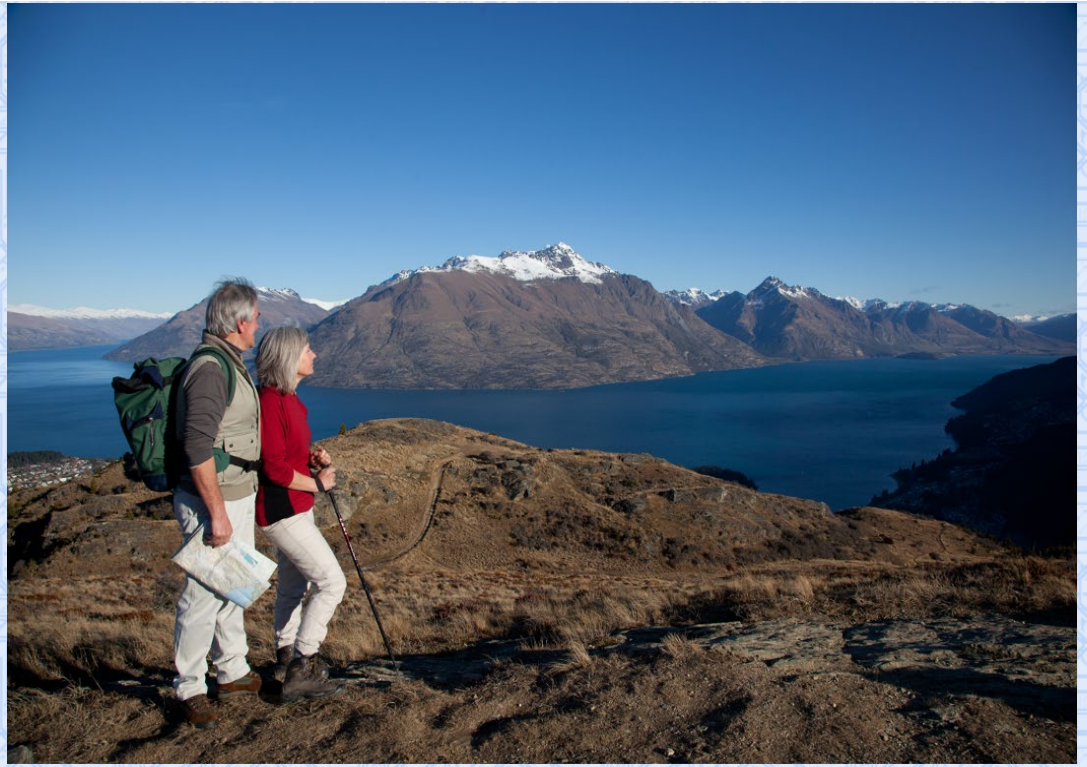
Hiking Queenstown Hill