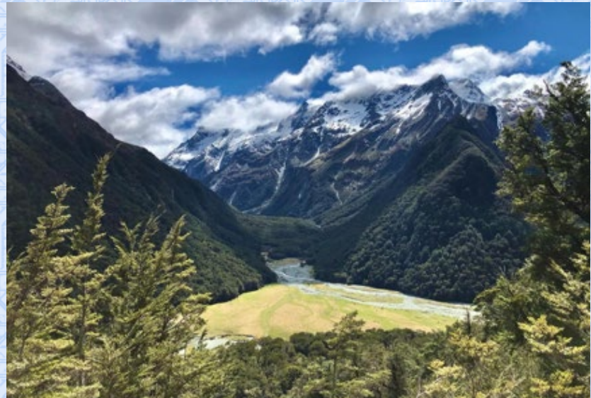
Hiking in the Chamonix area

Queenstown is considered by many an adventure capital of the world, with numerous outdoor and adventure activities both in the immediate area, and within a distance allowing a day tour and return by 16:00. There are other famous sites and activities nearby but too far to visit during ASIC, such as Milford Sound and many of the renowned 'tramps' or 'tracks'.