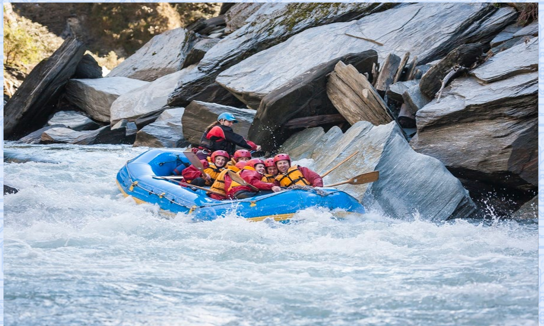
White water rafting, Shotover River, near Queenstown

Another favorite activity for families and individuals.