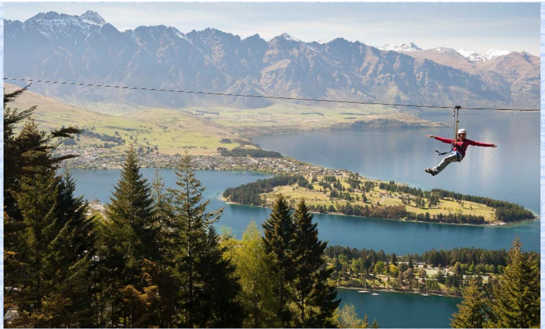
Ziplining over Queenstown