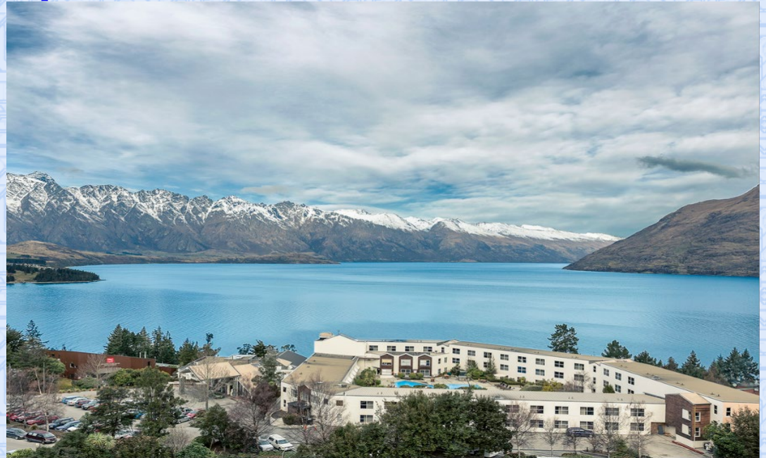
The Mercure Queenstown Resort

https://all.accor.com/hotel/1994/index.en.shtml?utm_campaign=seo+maps&utm_medium=seo+maps&utm_source=google+Maps