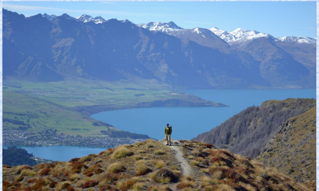
Ben Lomand Hike, just outside Queenstown