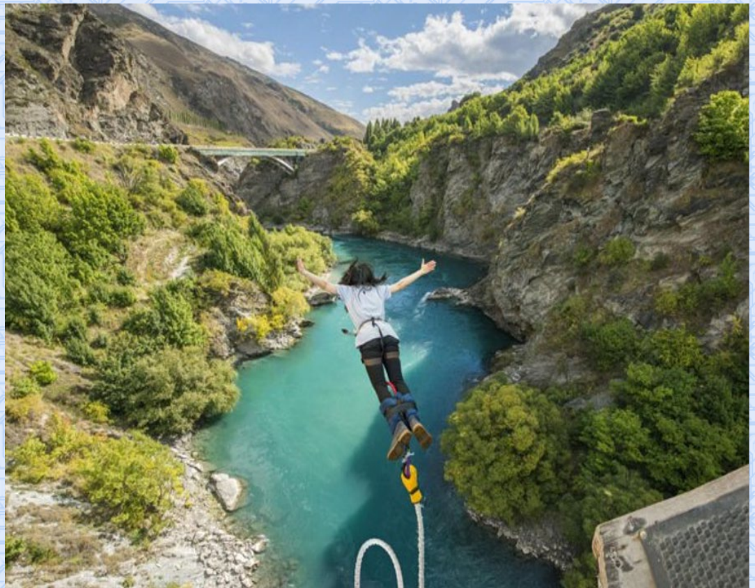
Bungee Jumping near Queenstown

Another exciting adventure, jumping from a bridge high over a canyon with feet attached to a bungee cord.