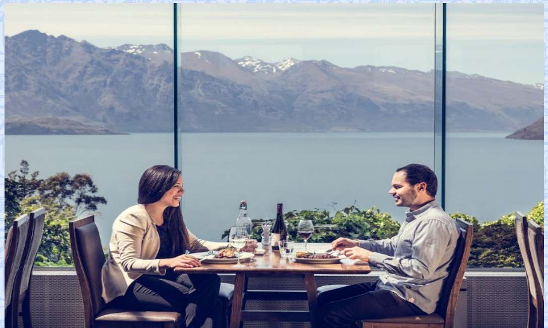
Above: Dining at the Mercure Queenstown Resort

The Mercure Queenstown Resort is a four star hotel with all the facilities