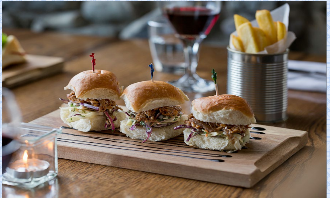
Food and drink at breaks