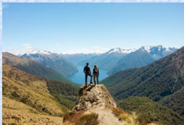
Views from Kepler Track New Zealand