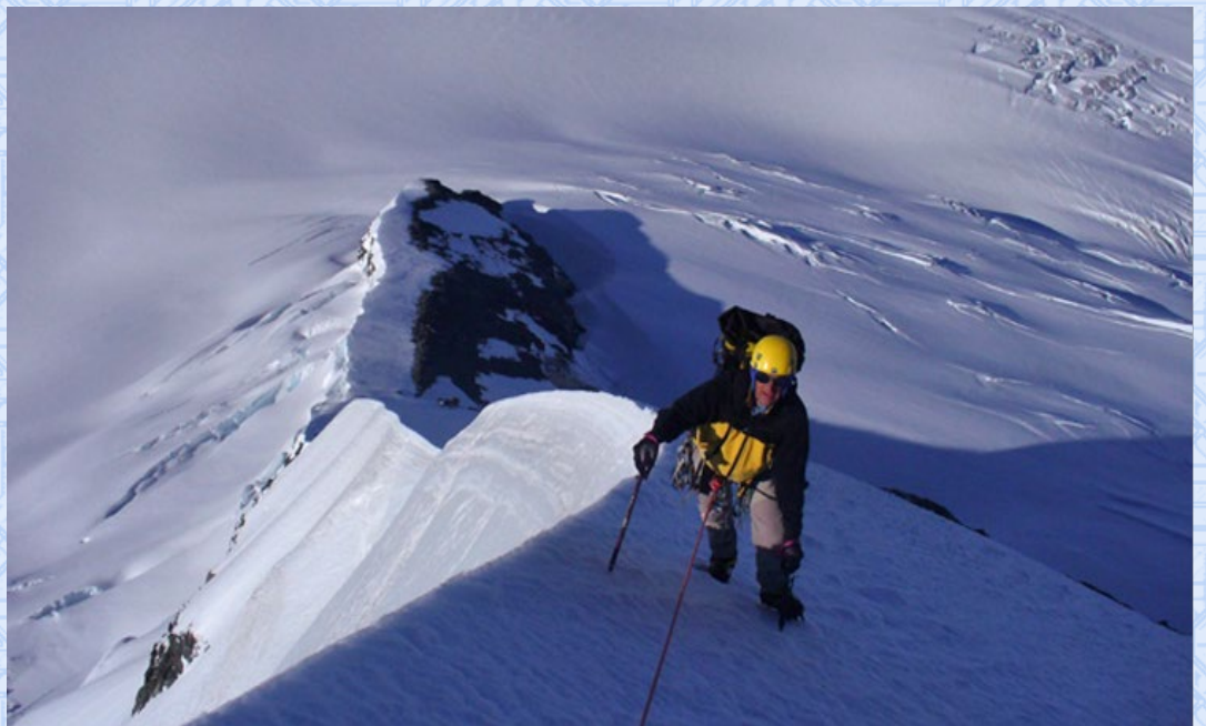
Mt Aspiring climb

The south island has many opportunities for mountaineering, beginning with Mt Cook (for experienced mountaineers) and including Mt Aspiring (not far from Queenstown). For those not very experienced these best be done with hire of local guides.