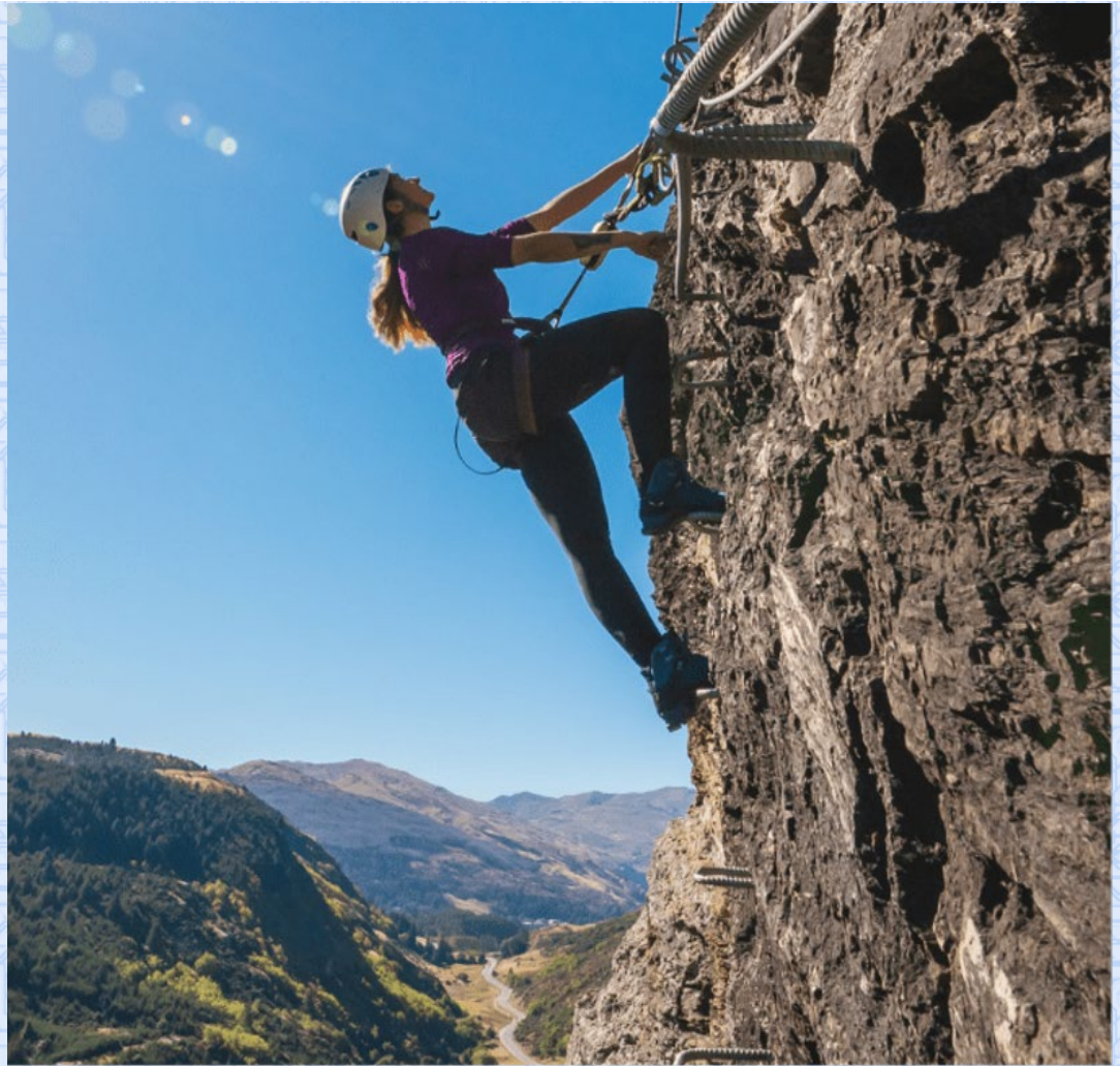
Via Ferrata near Queenstown