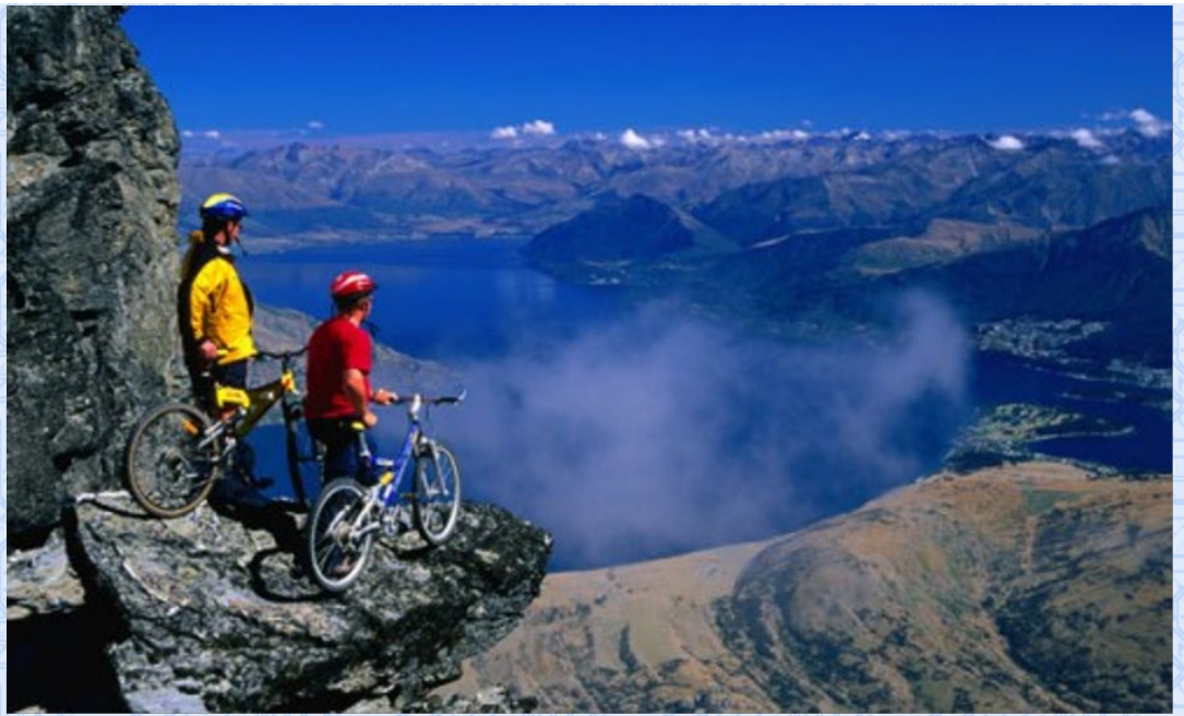
Above: Biking near Queenstown

The 22nd Annual Summer Interdisciplinary Conference (ASIC 2022 New Zealand ) will be held at the Mercure Queenstown Resort on Sainsbury Road, Fernhill, Queenstown 9300, New Zealand.